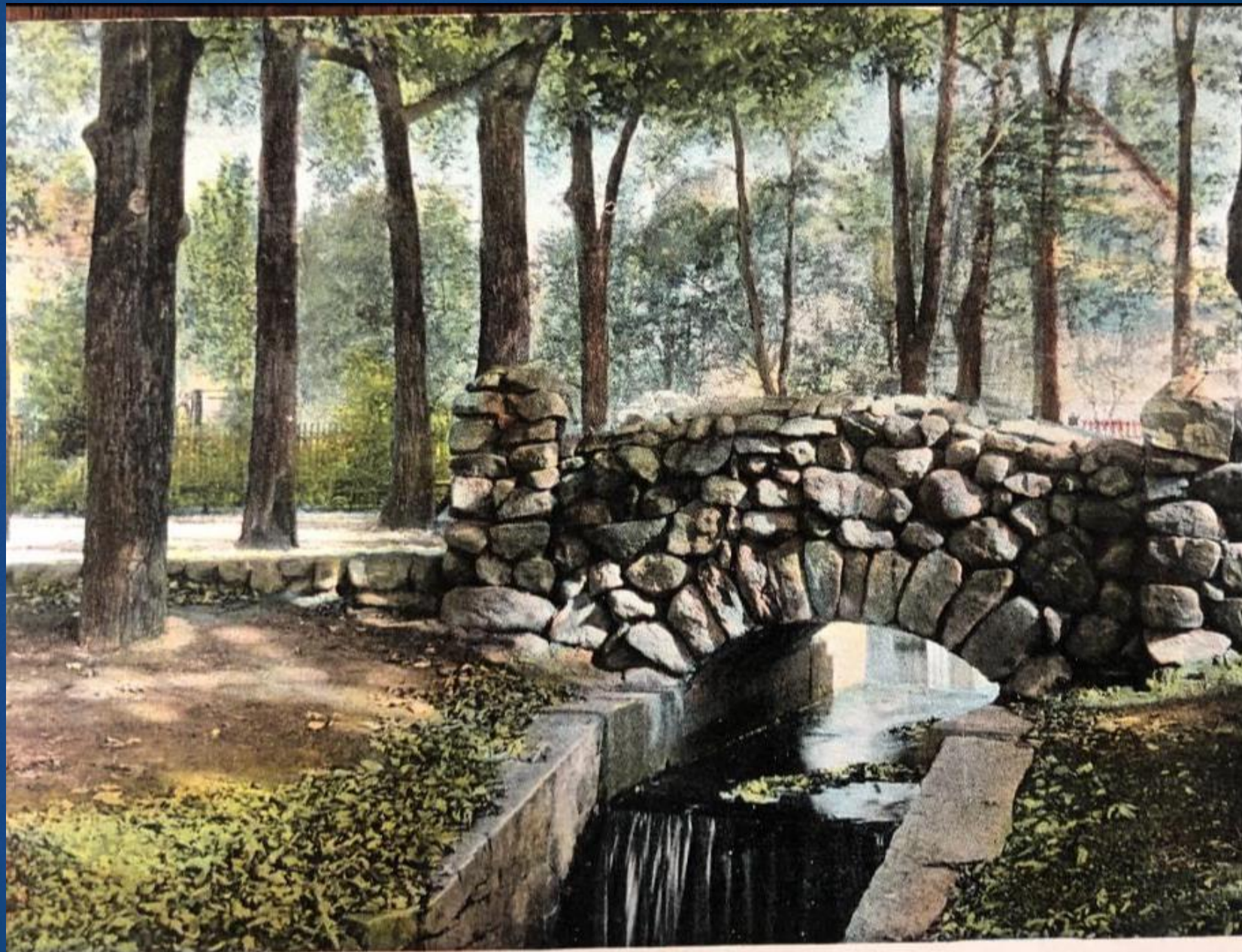
Rustic Bridge in Wilcox Park, Westerly, R. I.