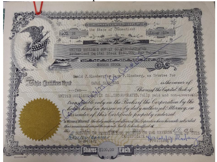
CANCELLED STOCK CERTIFICATE REPRESENTING TEN SHARES OF UNITED BUILDERS SUPPLY.

beautifully designed and very well-preserved, but they are also important for understanding the history of UBS, particularly who held the most stake in the business and its growth over time. Most of the certificate receipts are adorned with multiple documentary stamps from the Internal Revenue Service, providing a unique look into the history and evolution of these stamps.